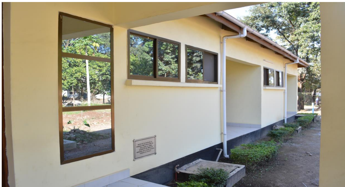
Kyela District Hospital (Grade A Ward)