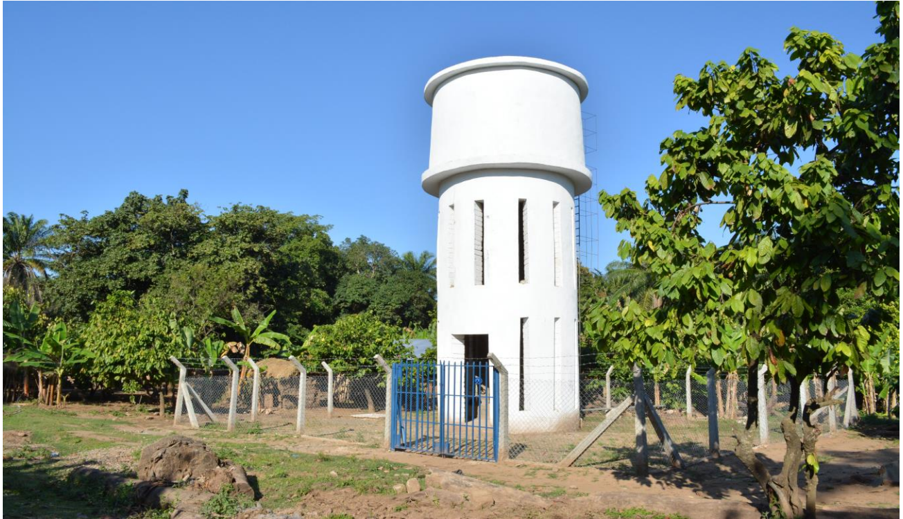
Lubaga Water Scheme