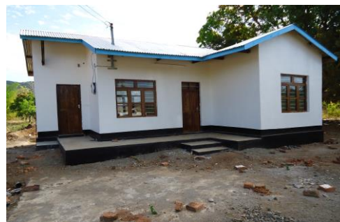
Busale Artificial Insemination Centre