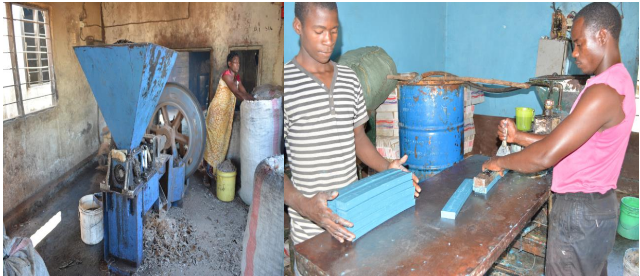
Small Scale Industries Soap production from Palm Oil-Kyela

Industrialization in Kyela District has not yet matured due to few small processing industries such as palm oil processing industries, carpentry and paddy husking industries. The major reason for low industrialization is due to the fact that the technology used is poor resulting into low production. Also under capitalization inhibits local Business men to engage into large scale production.