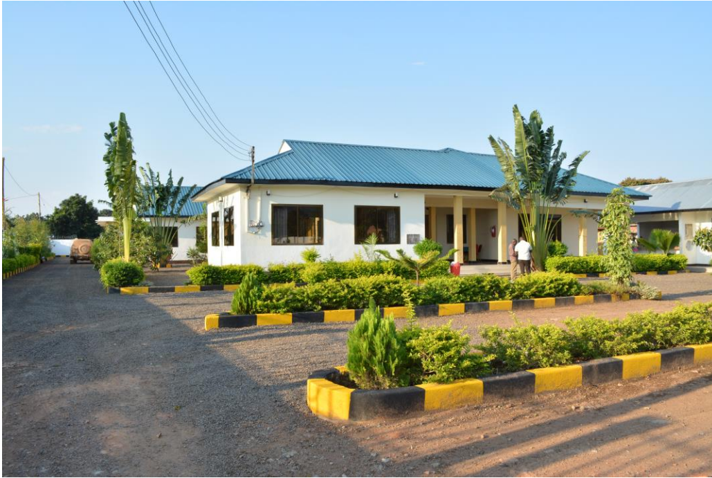
Songwe View Resort - Kasumulu Boarder