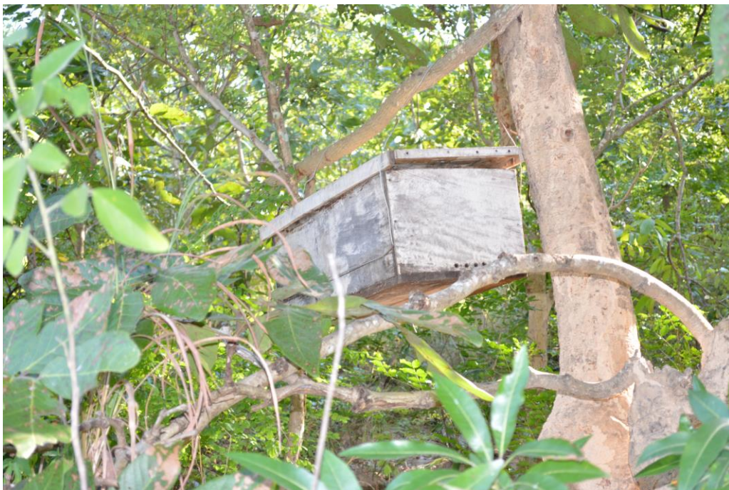
Beehives at Kasumulu Forest

Kyela District has Natural and Traditional forests. Katago is a commonly known Traditional forest. Natural forests are found in Busale, Ikombe and Ngana areas. The forests are used for various purposes such as bee keeping, natural herbs and acquisition of charcoal and fire woods.