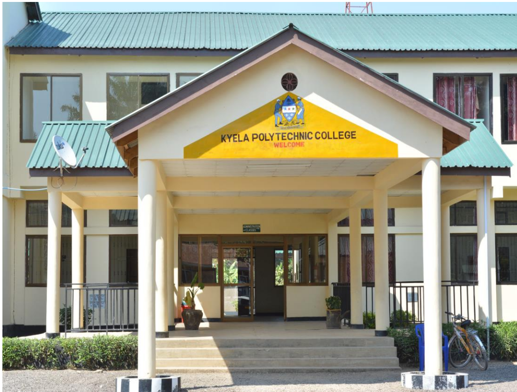
Kyela Polytechnic College