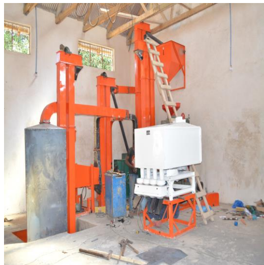
Kikusya paddy processing Industry -Kyela