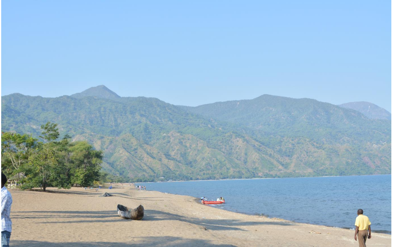
Livingstone Ranges along Matema and Ikombe village