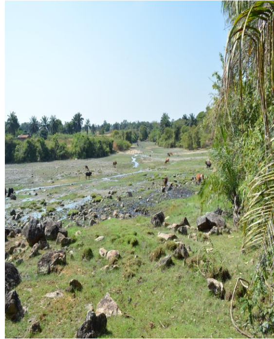
Kilambo Hot Water Spring