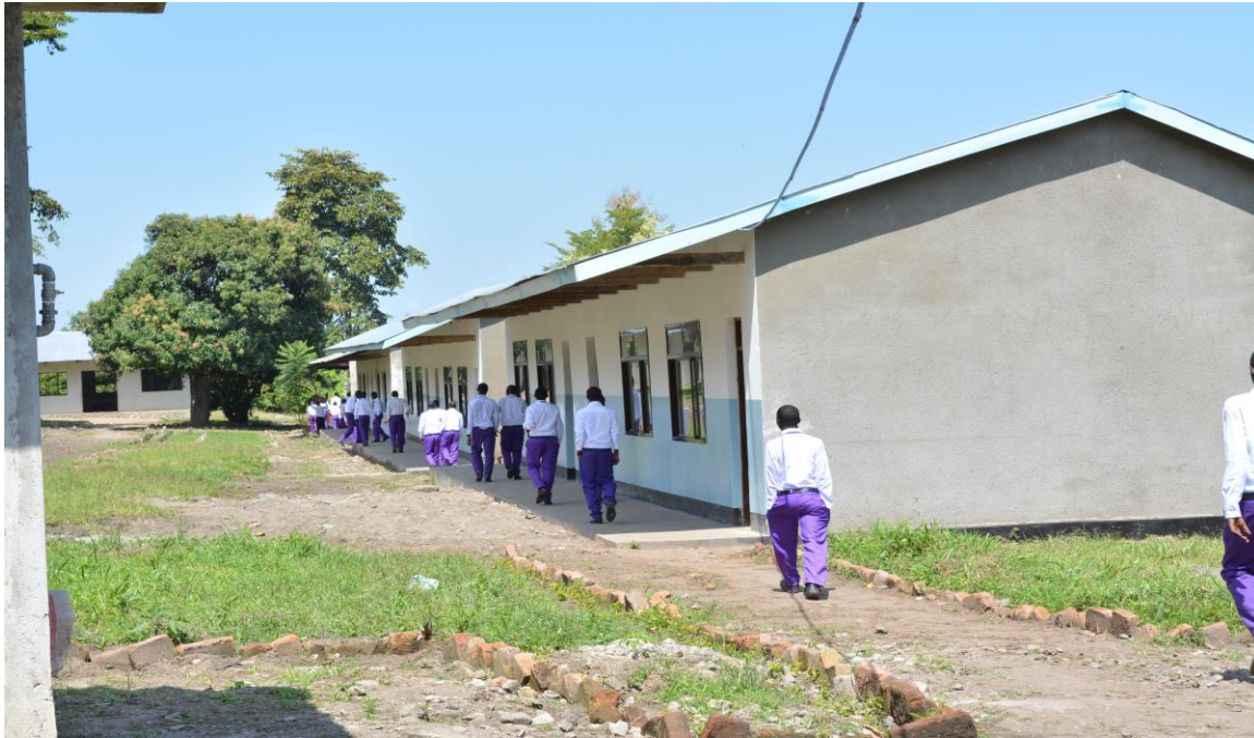
Matema Beach High School

High School. Two (2) Government High Schools have been started, these are Matema Beach High School and Kyela High School.