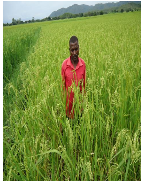
Paddy farm at Ngana Irrigation Scheme

To make sure agricultural and livestock services are improved in the District, three Ward Agricultural Resource Centres and nine Artificial Insemination Centres are constructed and operating.