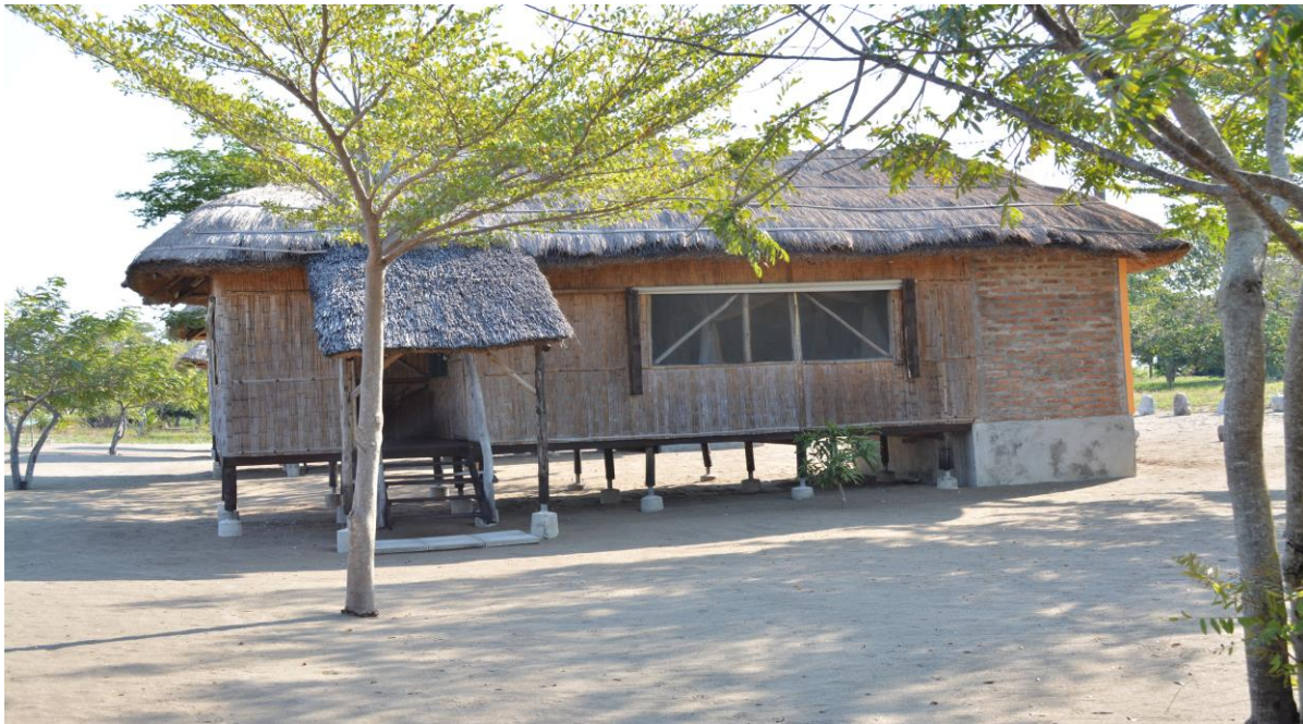
Blue Canoe Camping Site-Matema Beach

The attractions within the district include various beaches along Lake Nyasa, the main one being Matema beach and Mt Livingstone, Likyala Cave, Kilambo Hot Springs, Lyulilo Portary Making, Itungi Port and Suspension Bridges.