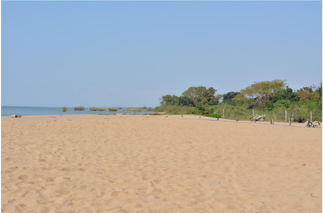
One of the most attractive beaches in the world: Ngonga beach Kyela