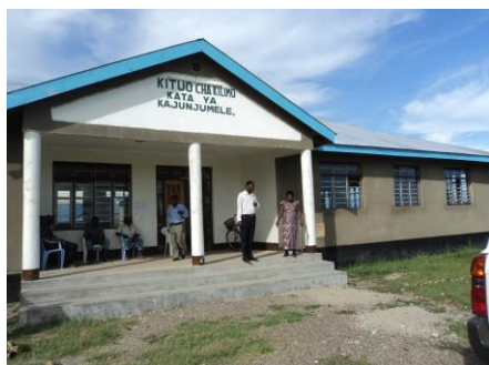
Kajunjumele Ward Resource Centre

To make sure agricultural and livestock services are improved in the District, three Ward Agricultural Resource Centres and nine Artificial Insemination Centres are constructed and operating.