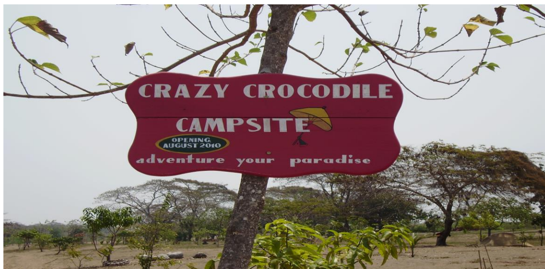
Crazy Crocodile Campsite at Matema Beach.

The District has potential wildlife such as Hippos, Crocodiles, Monkeys and snakes. Also Birds of different species such as Flamingo are found in the District. The abundance of hippos and crocodiles in Lufilyo River and along the shores of Lake Nyasa can highly impress and attract investors to establish game sanctuaries within the area. Also there is Matema area with 20 hectares which is suitable for Crocodile farming. Currently, the area has not been utilized for this purpose.