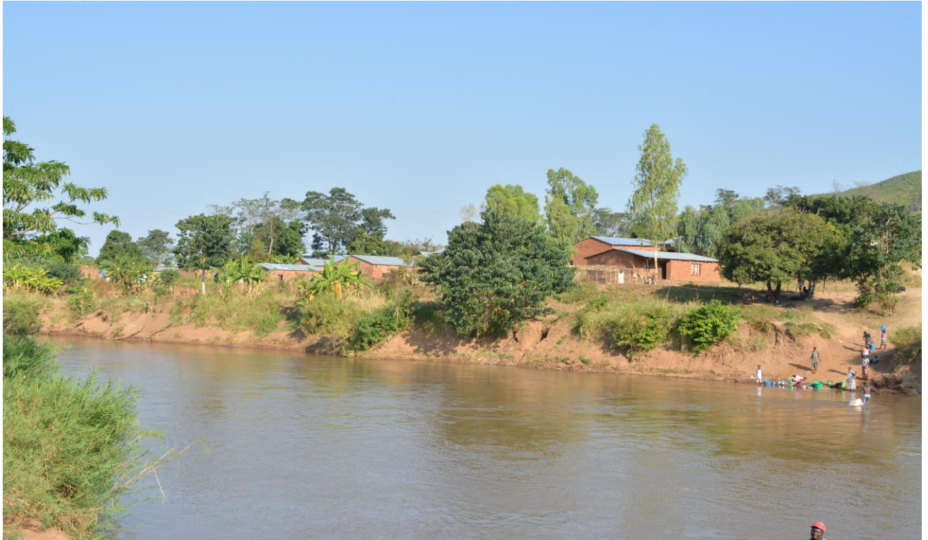
Songwe River Boardering Tanzania and Malawi