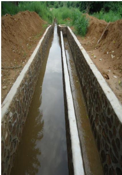
Ngana irrigation scheme main canal

established. Irrigation agriculture is highly insisted by the District Council. This is just to make sure people go with enough food throughout the Year and improve their living standards. The main irrigation scheme which is operating is Ngana irrigation scheme which is 209 Ha.