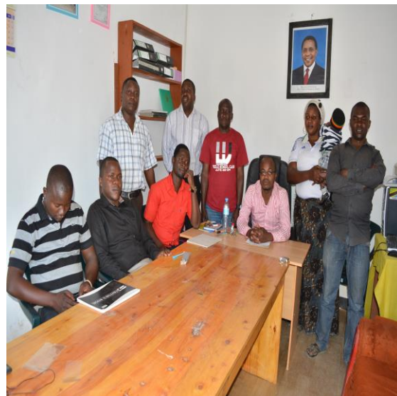
Members of Wadau Self Supporting Group-Kyela