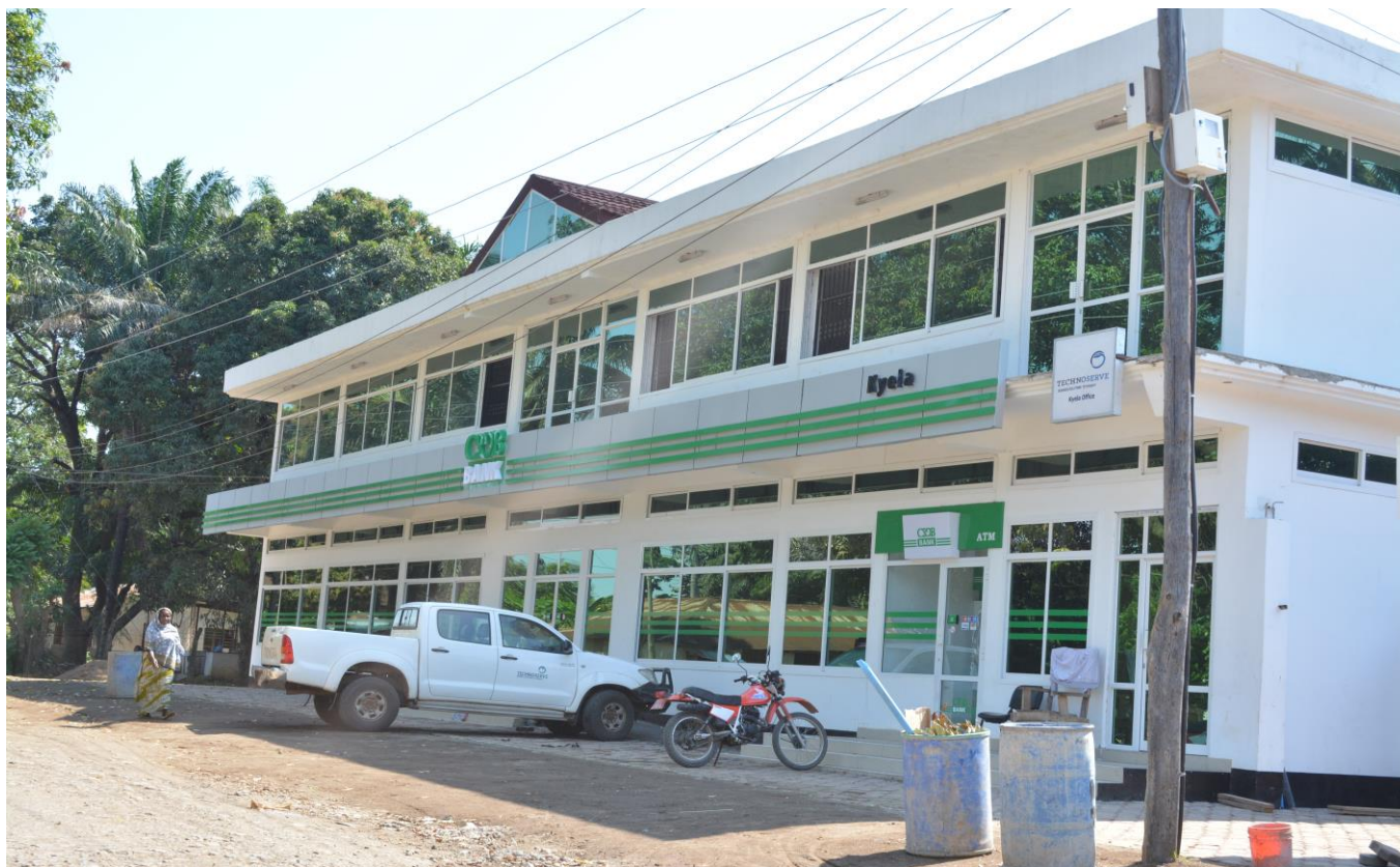
CRDB Bank-Kyela Branch