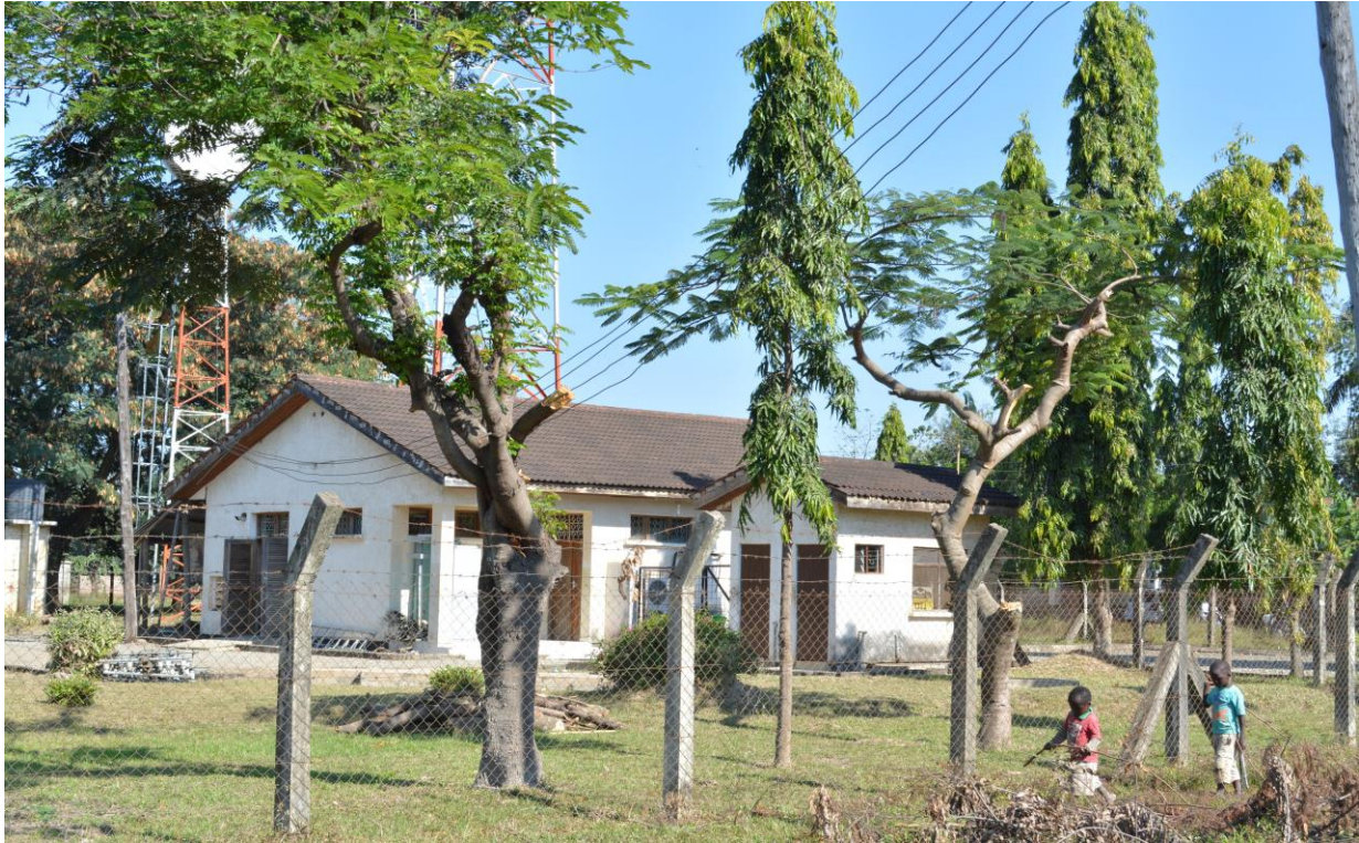
Tanzania Telecommunication Company Limited-Kyela