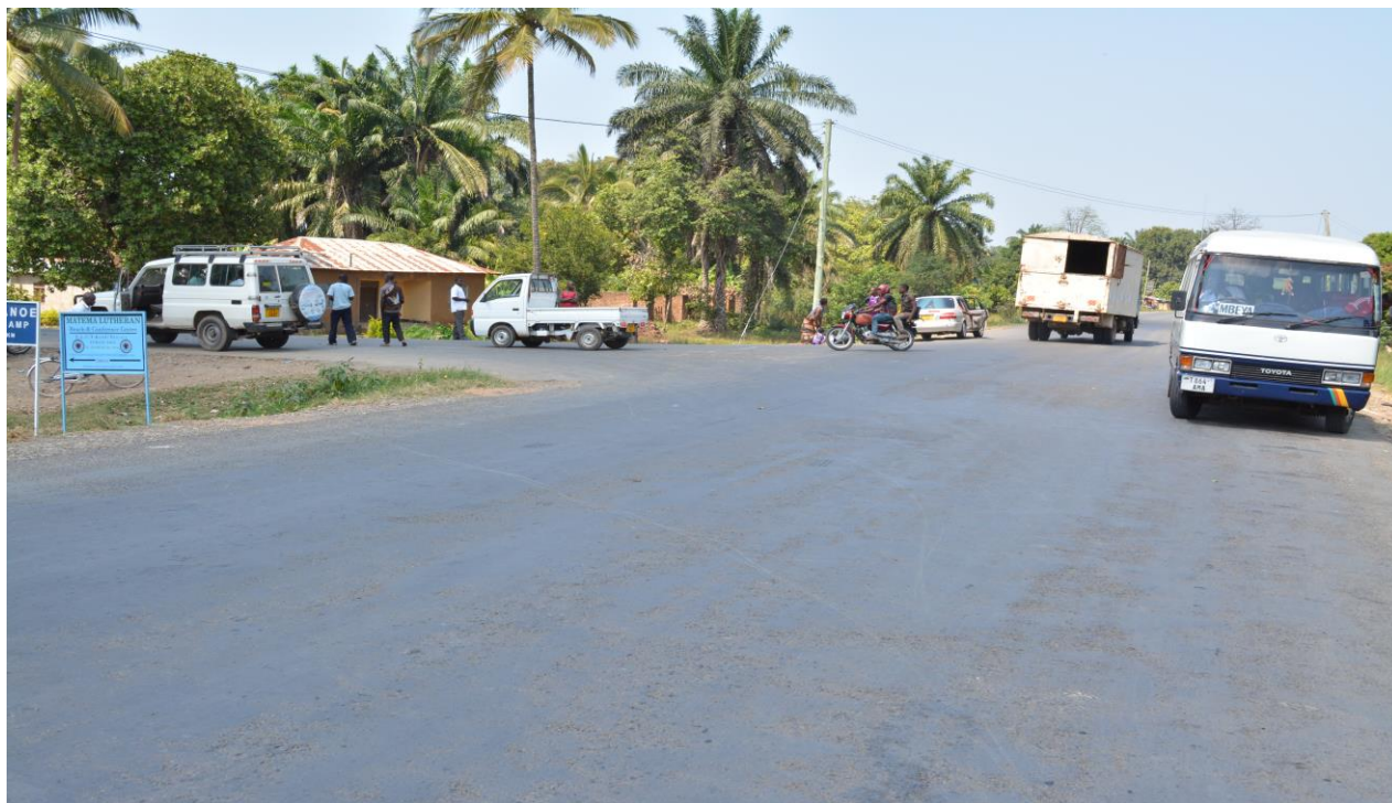
Kikusya-Ipinda –Matema Road