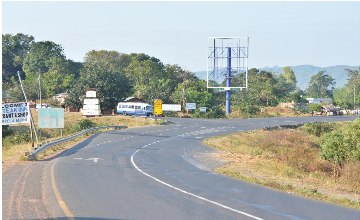
Mbeya-Kyela-Malawi High way

Kyela District is interconnected with a good network. A small part of town road system is covered by tarmac, about 40.5 km and about 125 km from Mbeya City to Kyela is a trunk road connecting the district to the Republic of Malawi. Many rural roads are gravel roads and are passable throughout the year.