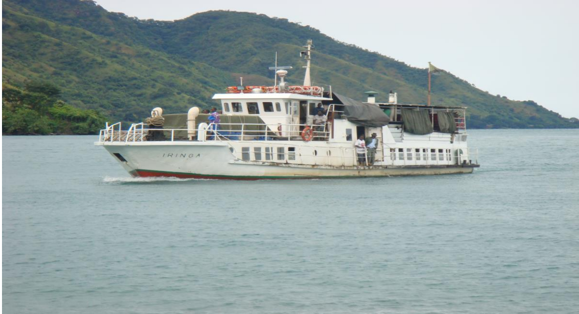
MV Iringa connecting the district with Iringa and Ruvuma regions