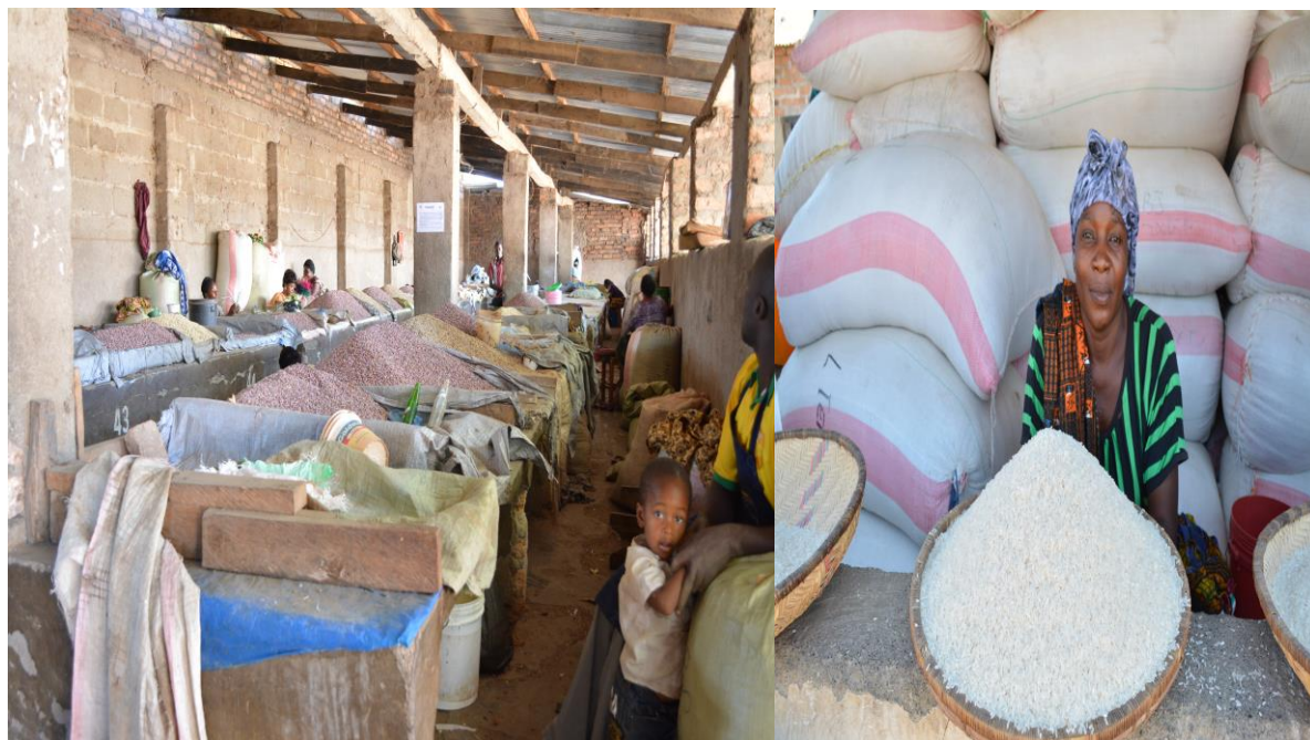
Indigenous Market-Kalumbulu Kyela

By insisting the policy of industrial concentration in one area, it will be easy to use the residue of one industry as the raw materials for example an industry processing palm oil carnal, its residue can be used as the raw materials for another industry packing animal feeds.