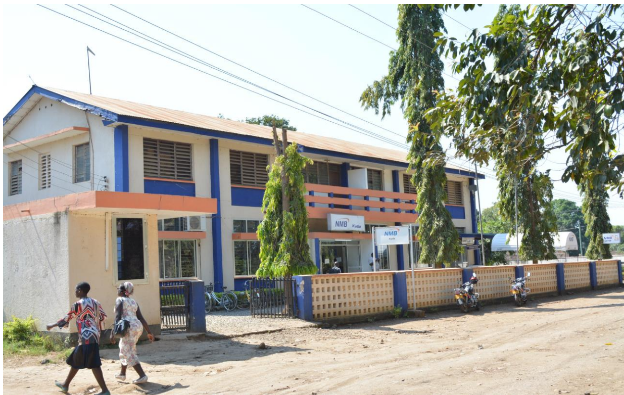
National Microfinance Bank- Kyela Branch