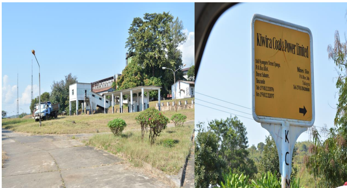
Kiwira Coal Mines